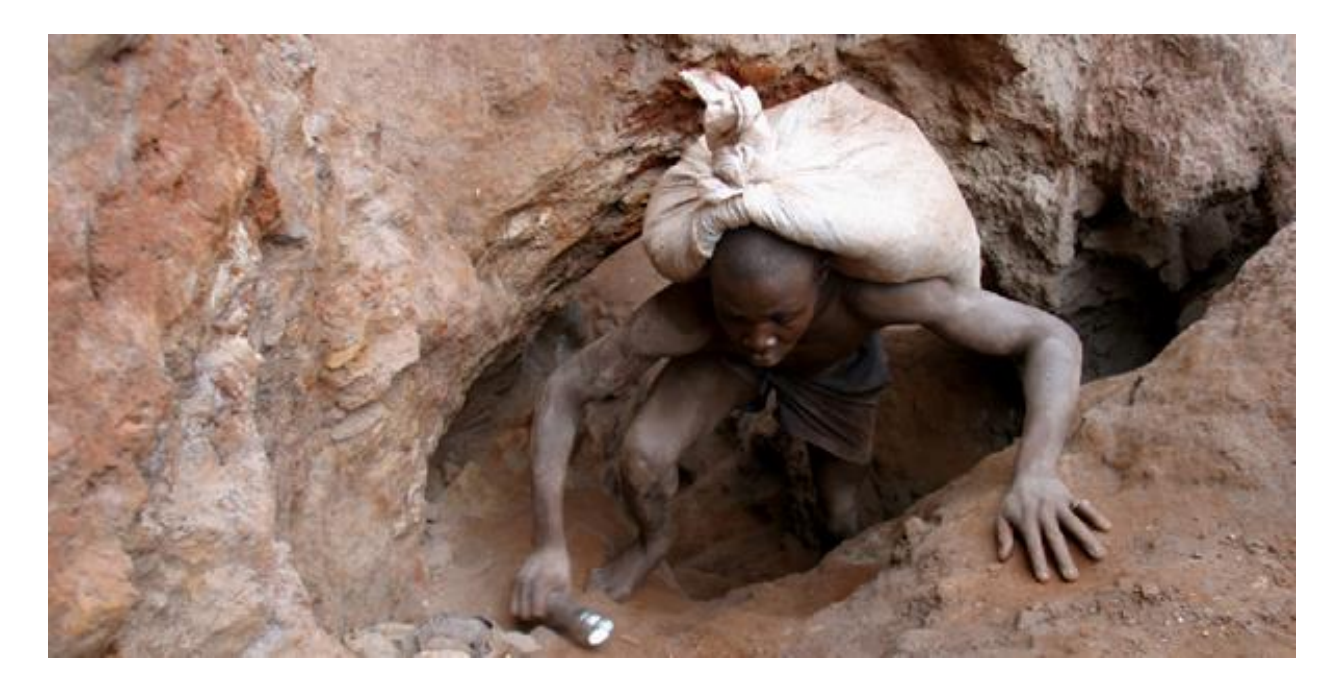
Slavery in Sub-Saharan Africa