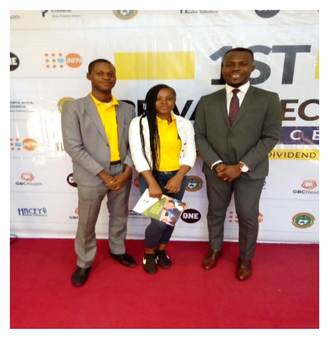
DELEGATES OF ASYARF AT THE EVENT

It was finally stated that, for private sectors to achieve the major aim of the conference, they need to keep pushing relentlessly till they get there.