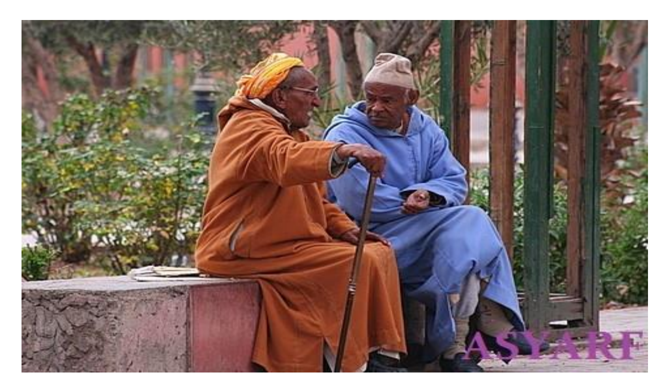
In commemoration of the celebration of Mother's day on 11<sup>TH</sup> March, 2018

Mother's Day is celebrated all around the world. It seems to be a universal thing that cultures put a day aside each year to celebrate the act of motherhood. To pay tribute both to the miracle of birth and to the special woman who performed that miracle: your mother. However not everywhere celebrates Mother's Day on the same 'Mothering Sunday' as the UK.