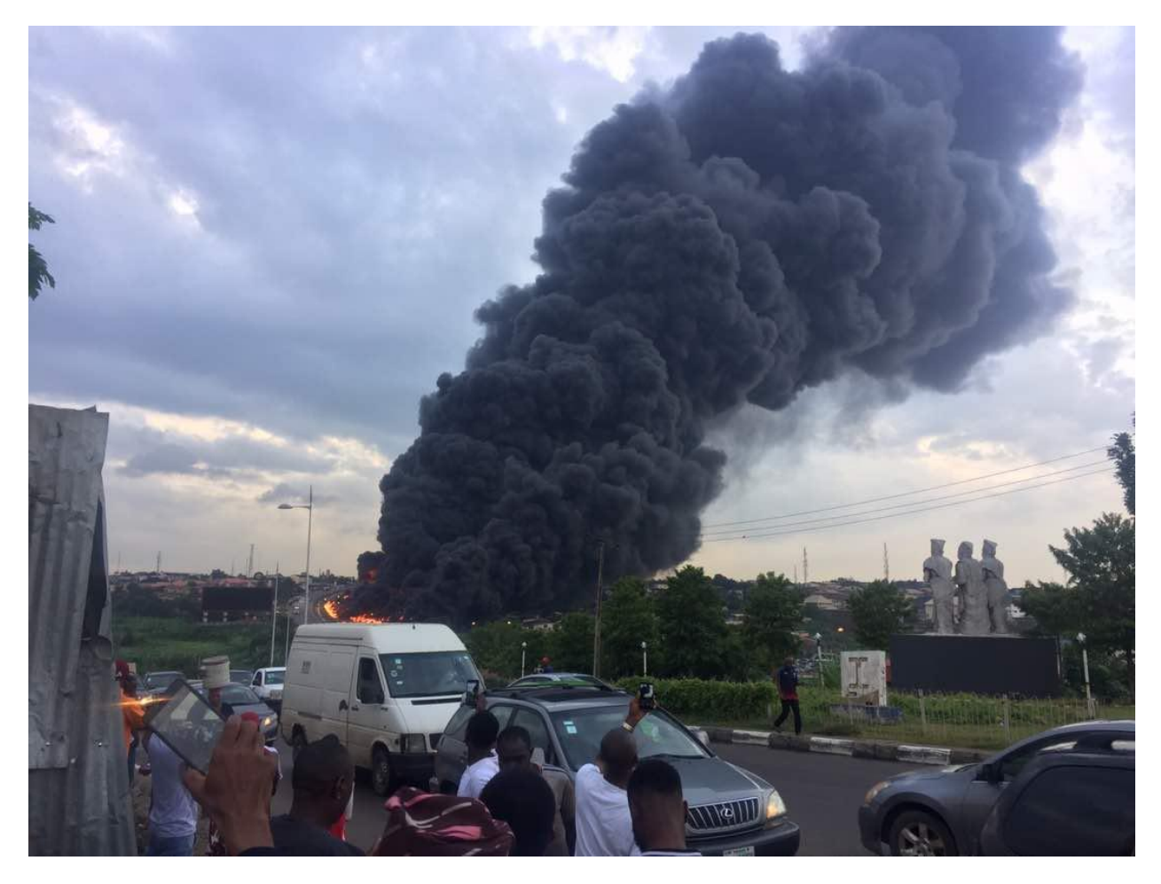
A Tanker explosion that claim lives and properties in Lagos

As part of ASYARF concerned efforts in always being at the fore front of Disaster Reduction, Risk Management and Disaster Management. The organization campaigned against disaster and urged the public to be mindful of the environment in other to avert disaster.